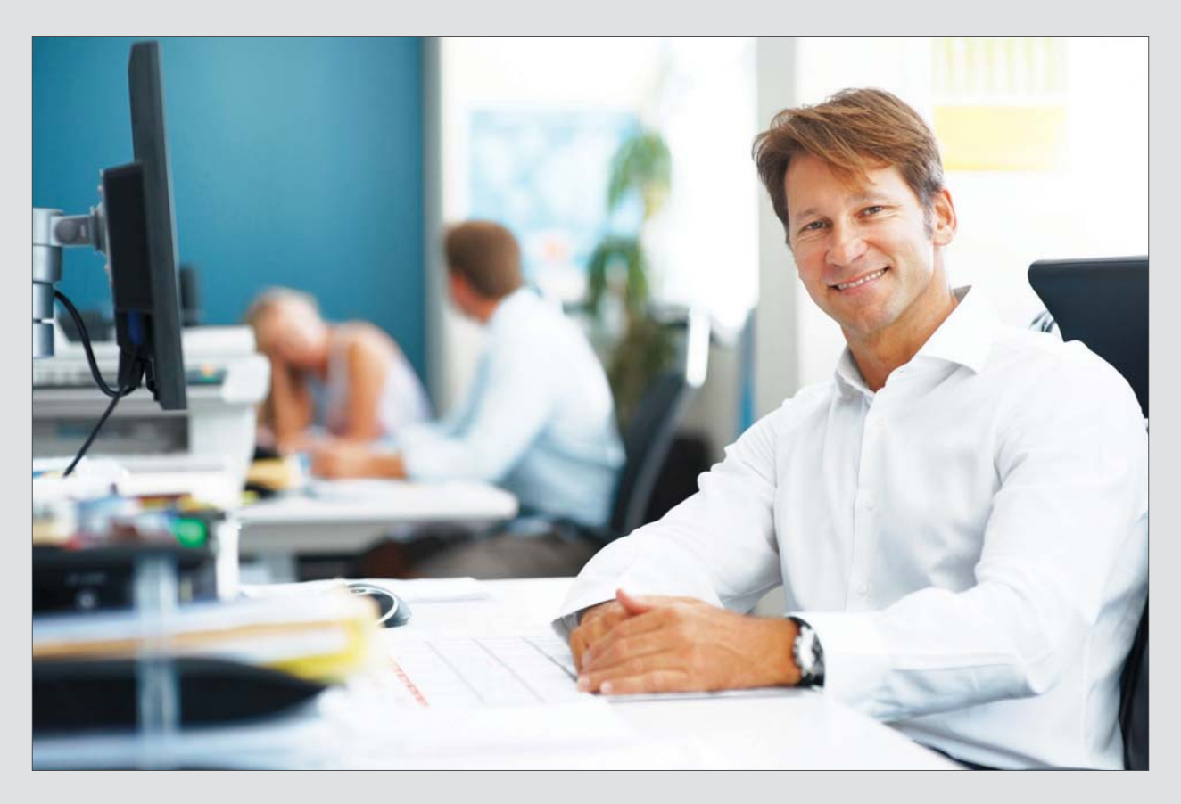
We can help you develop, implement and monitor a retirement or benefit plan that suits the needs of your business and your employees.