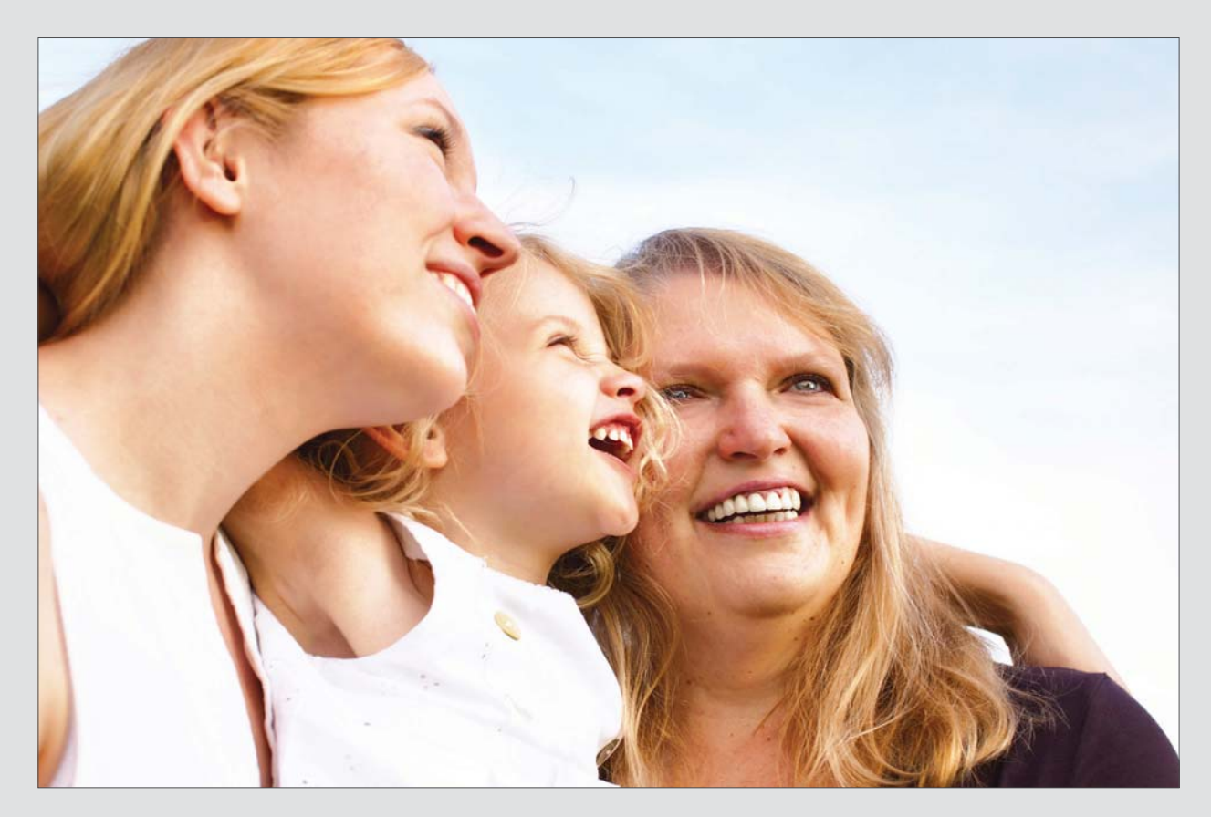
Nothing beats the feeling of knowing there's someone you can count on to look after you and the things that matter most in your life.